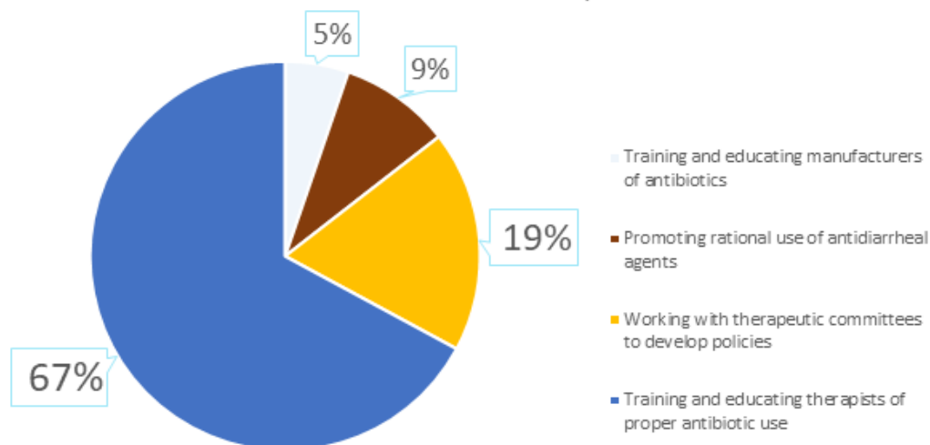
Figure 1. Role of pharmacist in antimicrobial stewardship